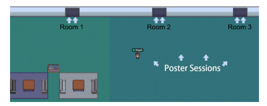
Fig.3: Poster Session Hallway will lead you to the doors of the thematic Poster Rooms 1, 2, and 3. All poster sessions will take place in these Rooms.