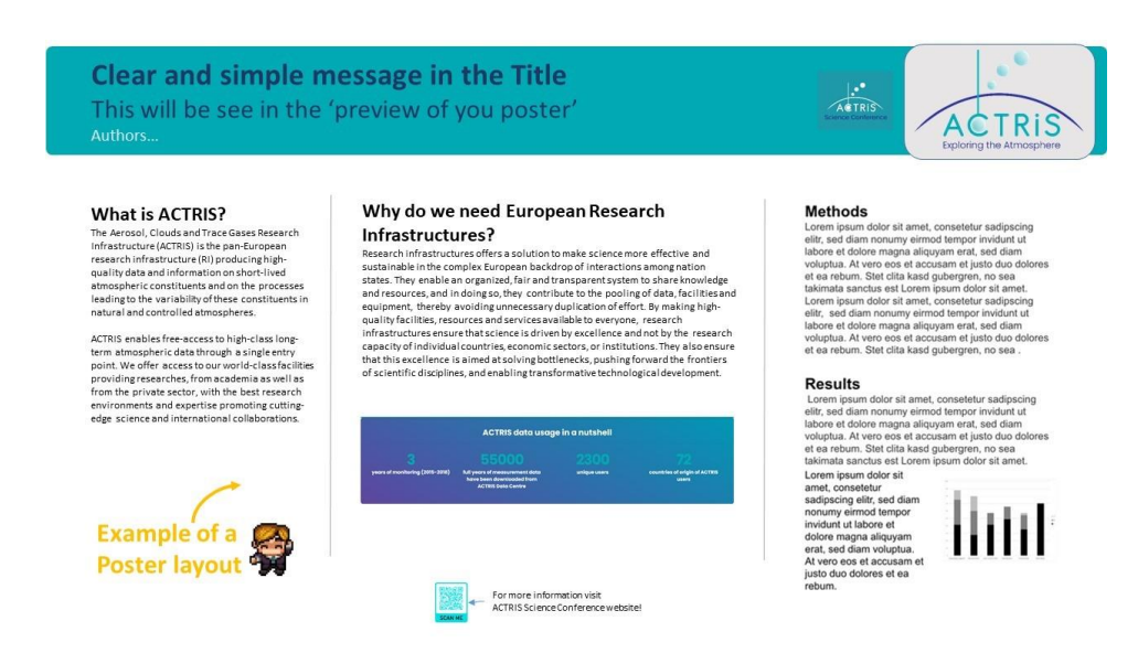
Fig.1: Example of a poster image created as 1 slide in power point.

For more technical information visit the Gather support website: <a href="https://support.gather.town/help/what-do-i-need">https://support.gather.town/help/what-do-i-need</a>