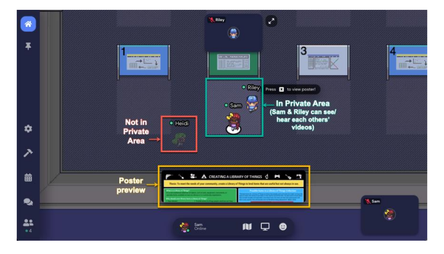
Fig.5: Poster's "private area". Only conversations inside the Private Area are heard and all other noise in the room is blocked out. Participants near your poster will also see a 'preview' image of your poster.